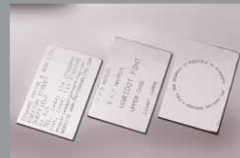
Marks Using BenchDot™ with 3000 Controller