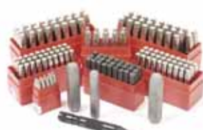
Manual and Press Marking

Pryor Marking Technology Egerton Street, Sheffield S1 4JX, UK Tel: +44 (0)114 276 6044 Fax: +44 (0)114 276 6890 Email: enquiries@pryormarking.com Web: www.pryormarking.com