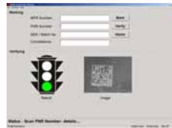
Traffic light feedback screen in Mark2Verify™