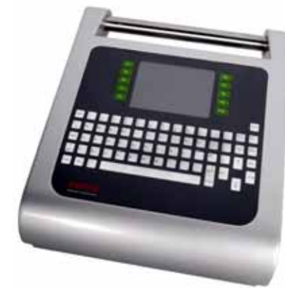
3000 series controller