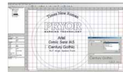
User interface in MarkMaster™ (Advanced) software