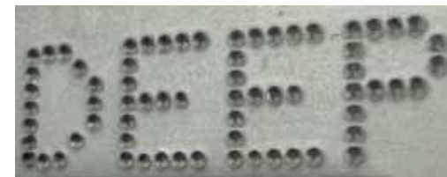
Deep mark with BenchDot™ DP series machine