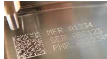
Data matrix code using BenchDot™ series machine