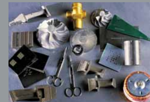
BenchDot™ systems are extremely versatile with the ability to mark almost any shape part