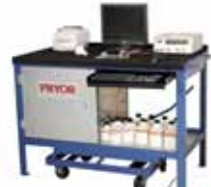
Electro-Chemical Etch Series